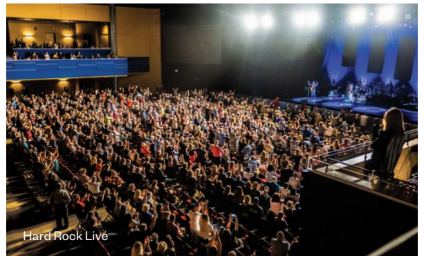
Hard Rock Live

opportunities are being created to meet the demands of the venue,” he says. “These are great jobs, living-wage jobs, with a full benefits package. It’s important to acknowledge that the money spent on the venue helps to boost the economy.”