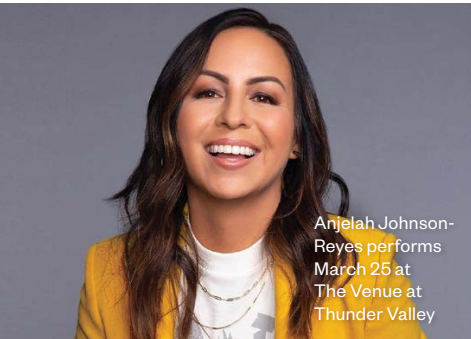
Anjelah Johnson-Reyes performs March 25 at The Venue at Thunder Valley