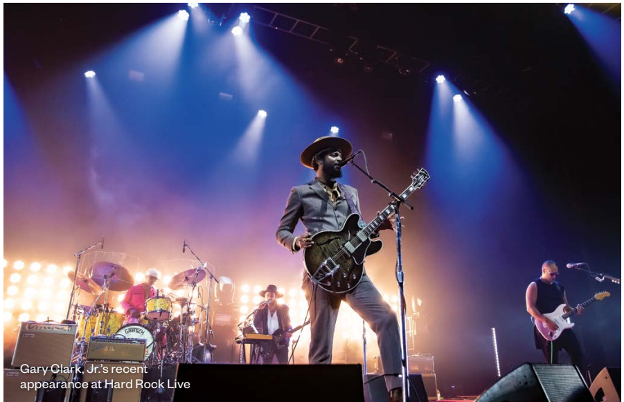
Gary Clark, Jr.'s recent appearance at Hard Rock Live

very large video walls. “To me, it almost feels like a small arena.”