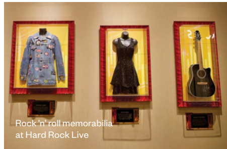
Rock 'n' roll memorabilia at Hard Rock Live

Free Hard Rock Live Free The Venue at Thunder Valley