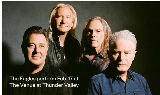
The Eagles perform Feb. 17 at The Venue at Thunder Valley