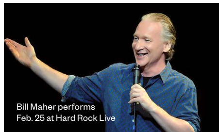
Bill Maher performs Feb. 25 at Hard Rock Live